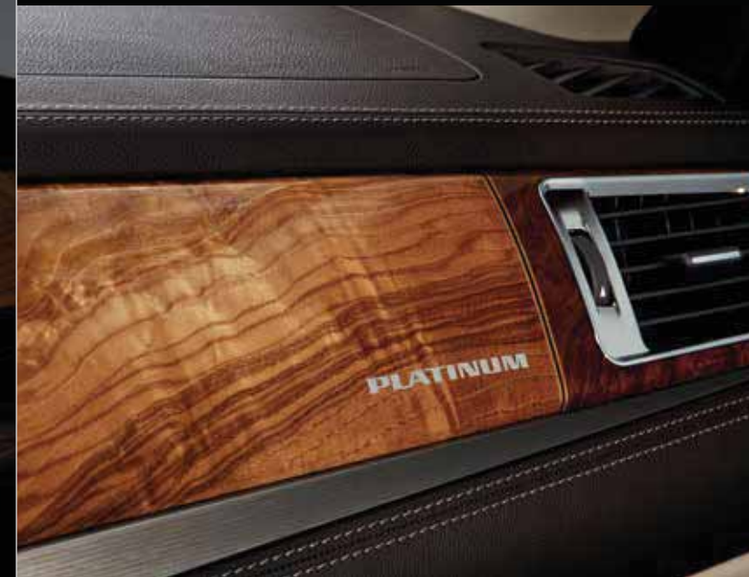
OLIVE ASH AND BURLED WALNUT WOOD TRIM