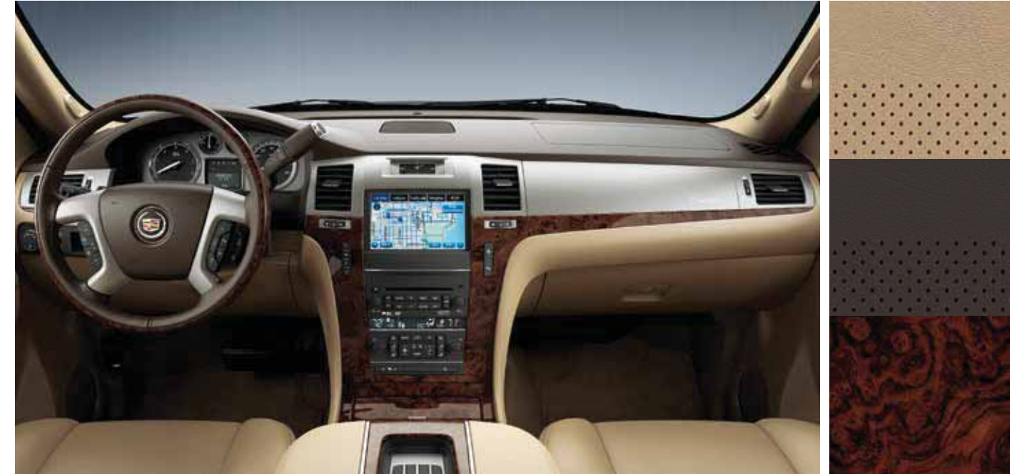
Cashmere Nuance Leather with Cocoa Accents