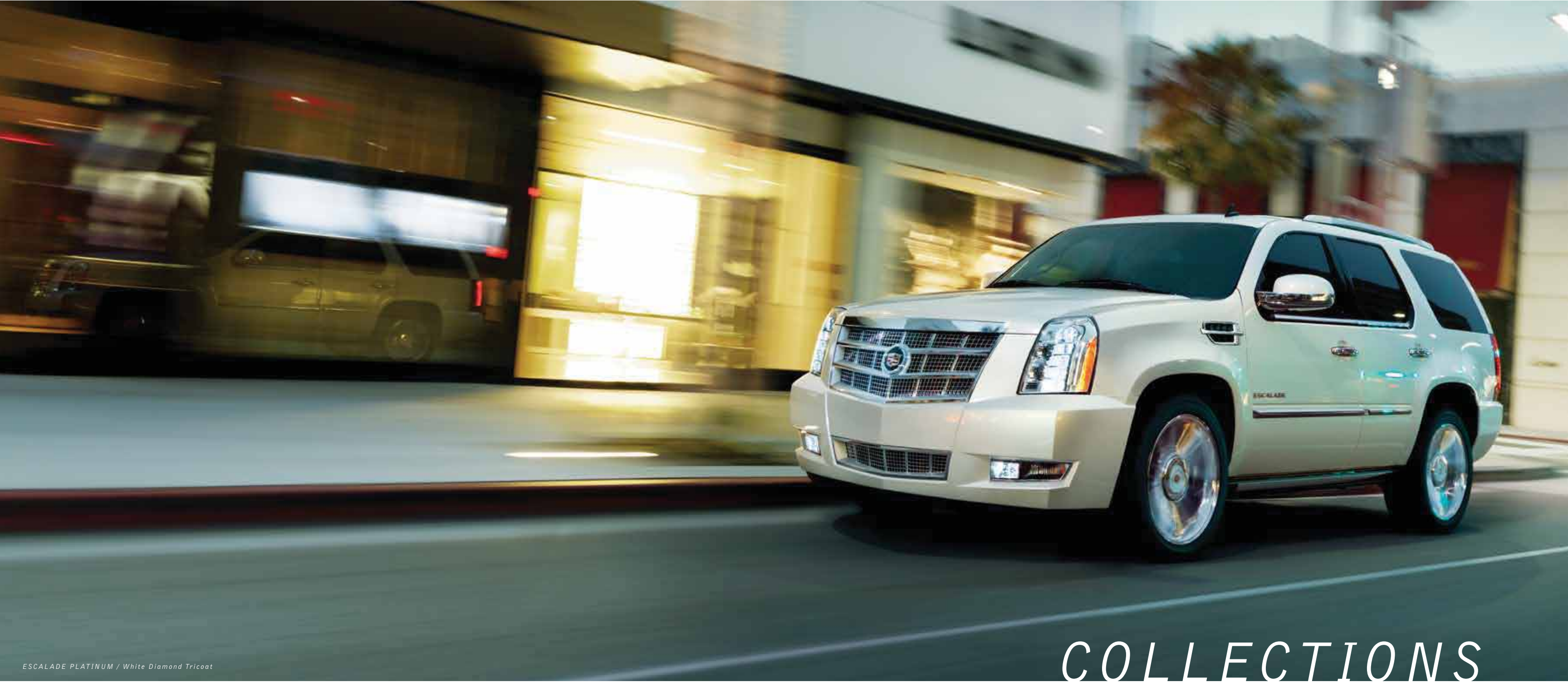
ESCALADE PLATINUM / White Diamond Tricoat