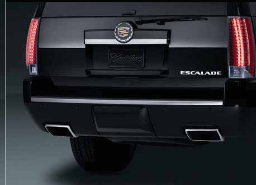
INTEGRATED DUAL-OUTLET EXHAUST