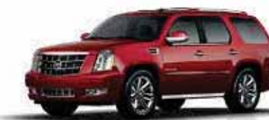
CRYSTAL RED TINTCOAT 1