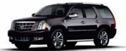
MIDNIGHT PLUM METALLIC 1