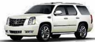
SILVER COAST METALLIC