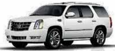
WHITE DIAMOND TRICOAT 1