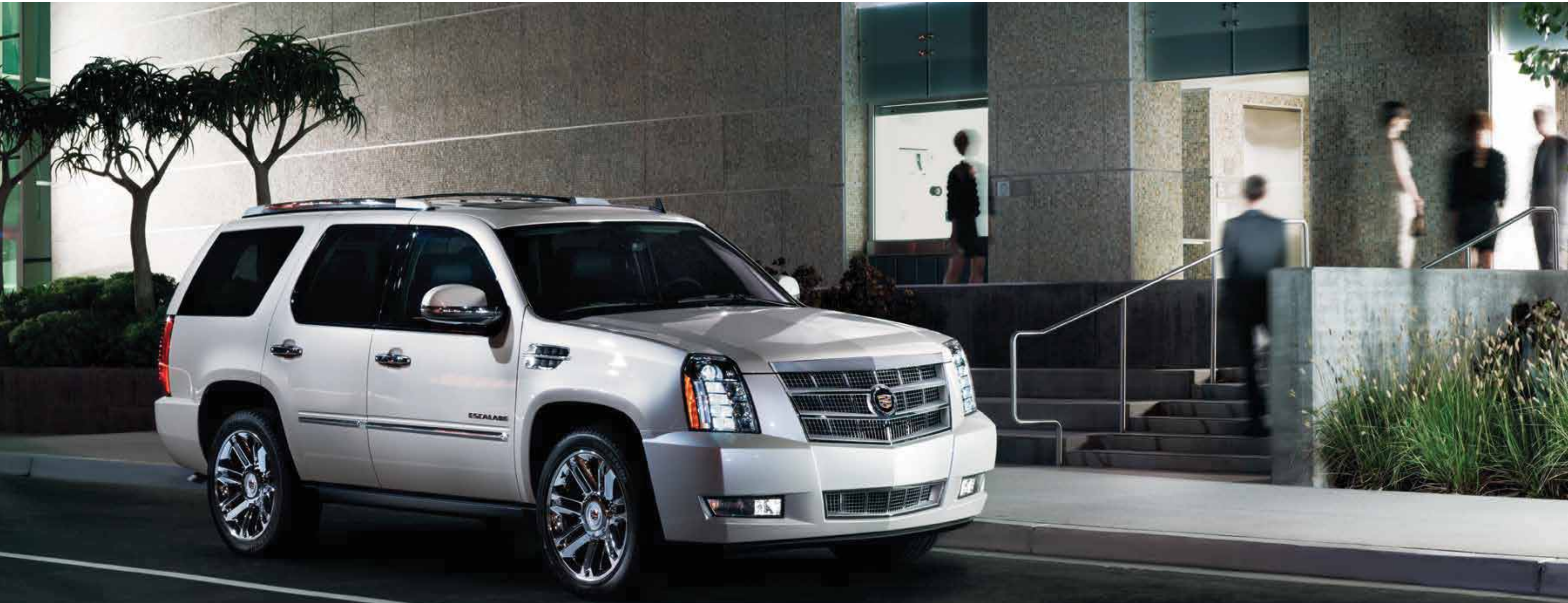
ESCALADE PLATINUM / White Diamond Tricoat