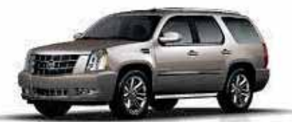
MOCHA STEEL METALLIC