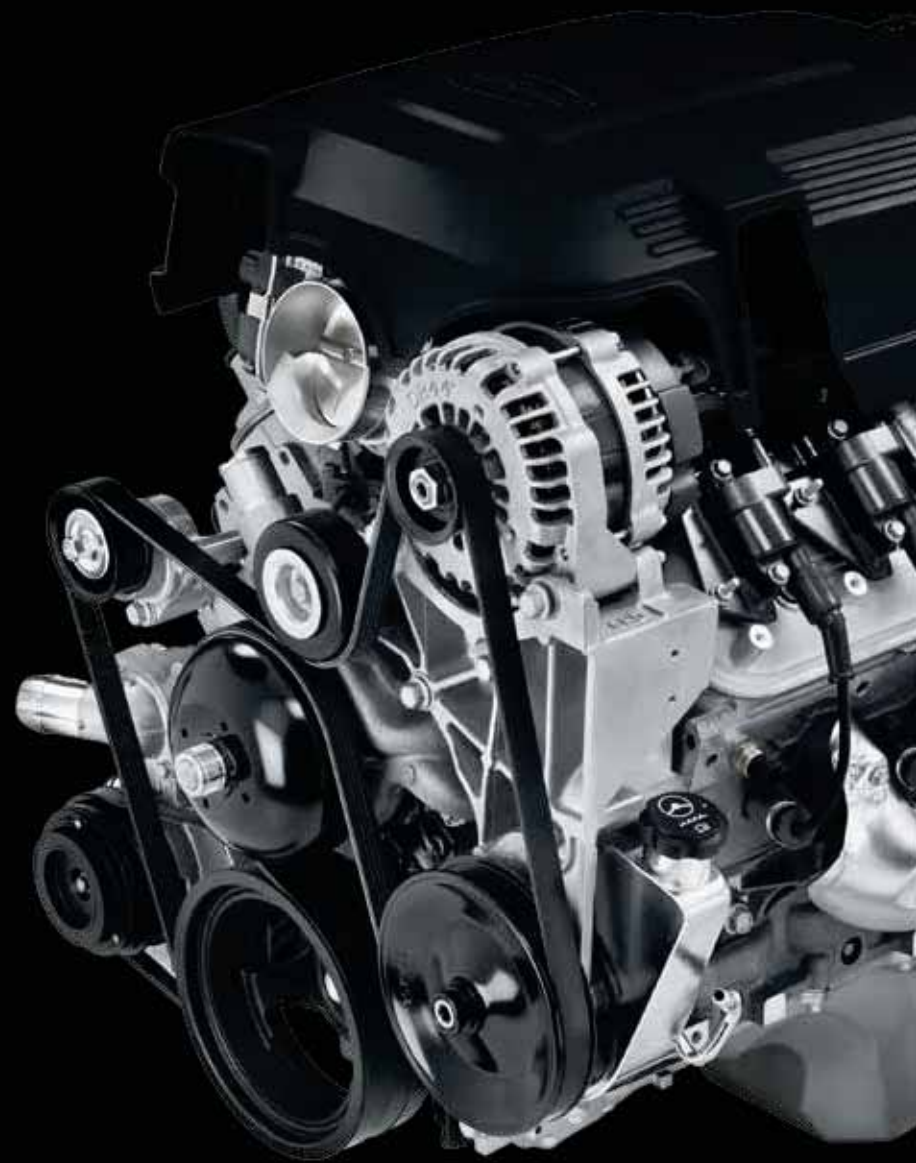
THE 403 HP 6.2L V8 ENGINE

Available All-Wheel Drive and a rear locking differential get all 403 HP to the pavement with confidence. Once on your way, available Magnetic Ride Control helps maintain a balanced ride. In the time it takes you to blink, this suspension system has monitored the road 1,000 times. Magnetic particles suspended in a fluid then react to a magnetic field and instantly align to provide the proper damping.