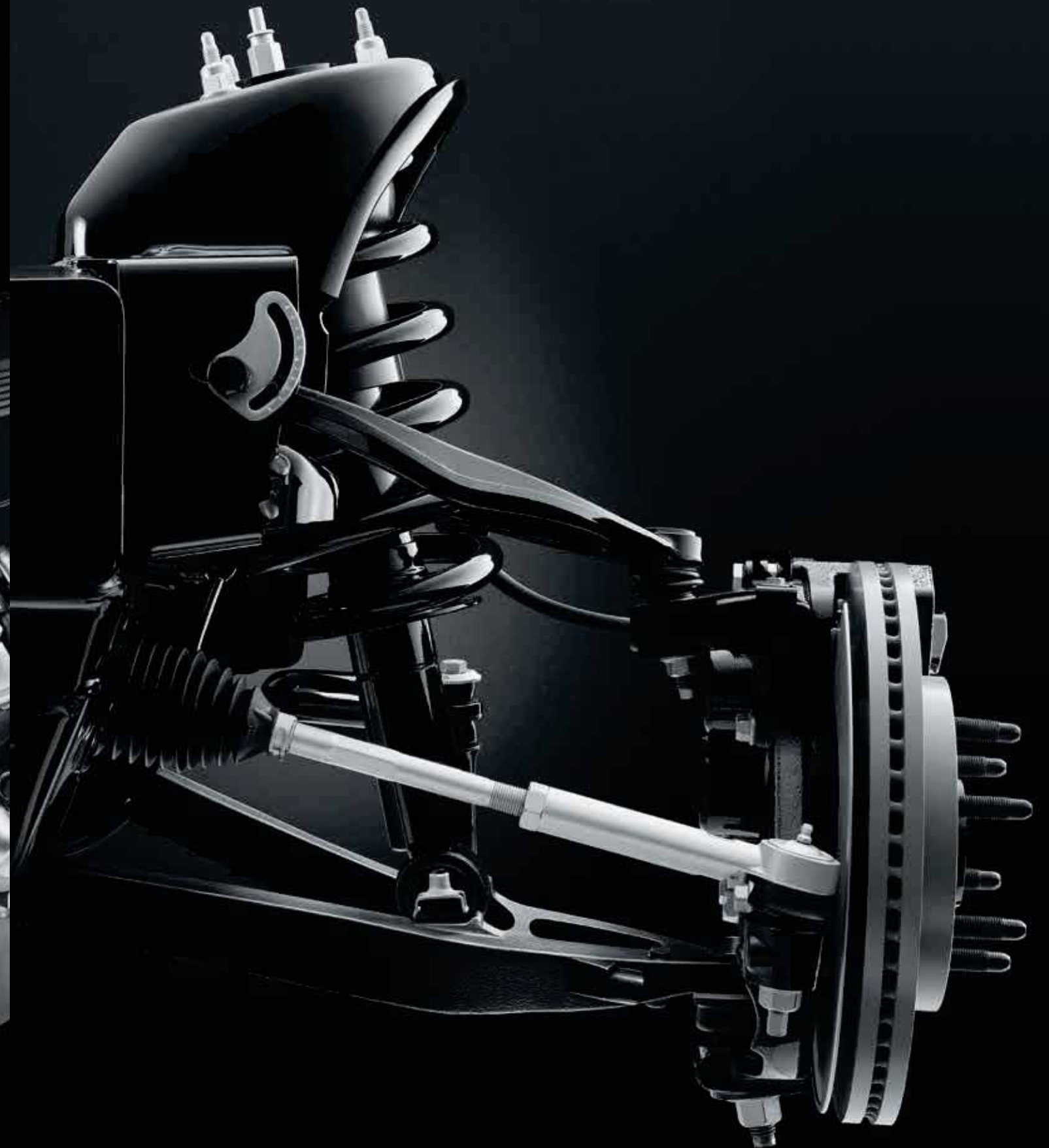
MAGNETIC RIDE CONTROL SUSPENSION