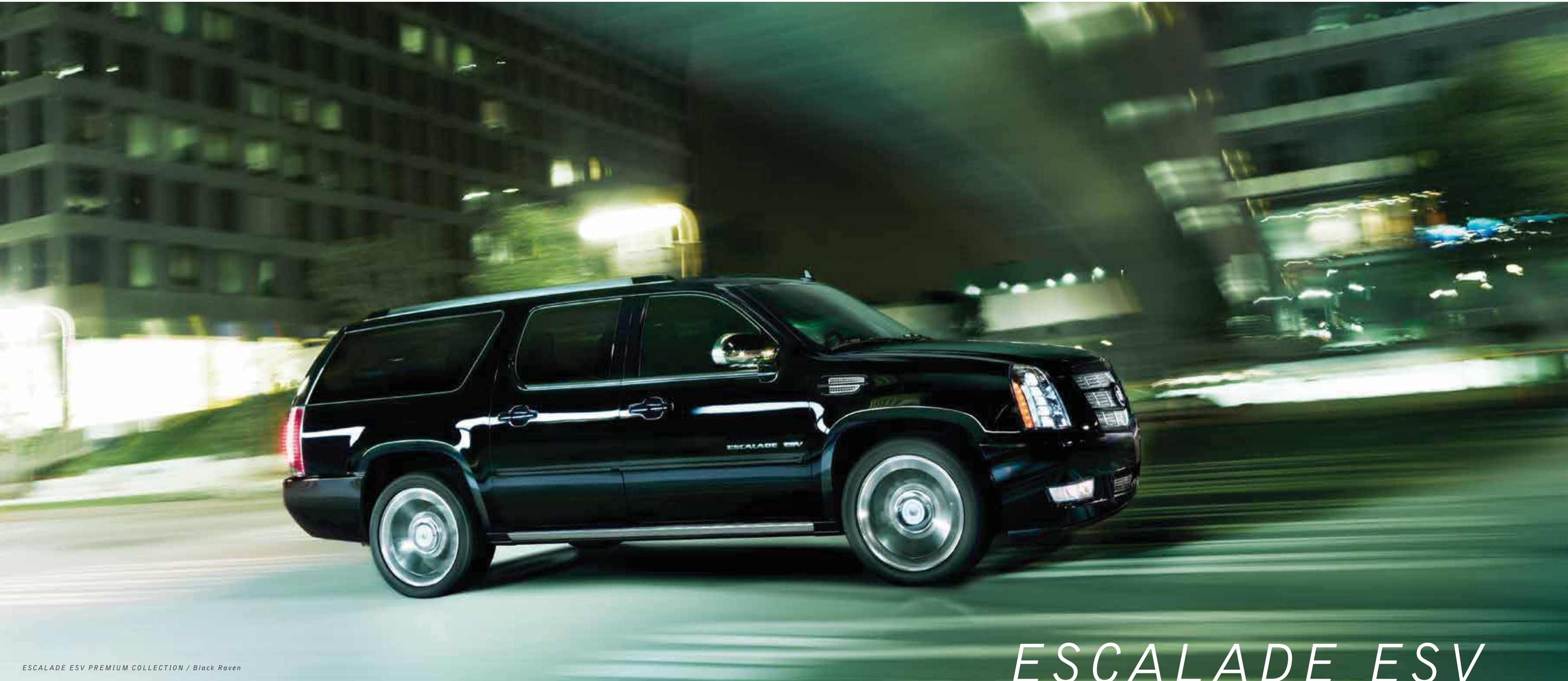
ESCALADE ESV PREMIUM COLLECTION / Black Raven