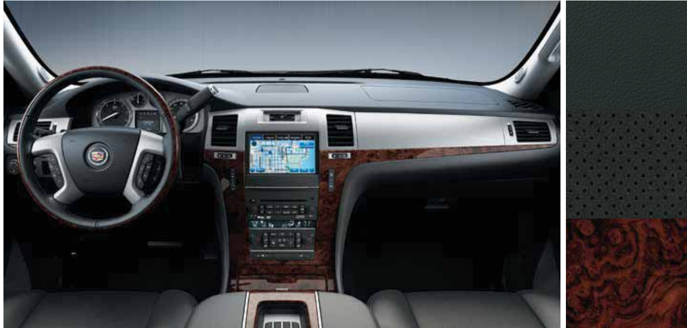
Ebony Nuance Leather with Ebony Accents