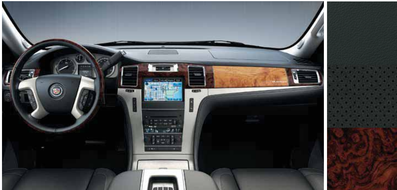
Ebony Aniline Full Leather with Ebony Accents