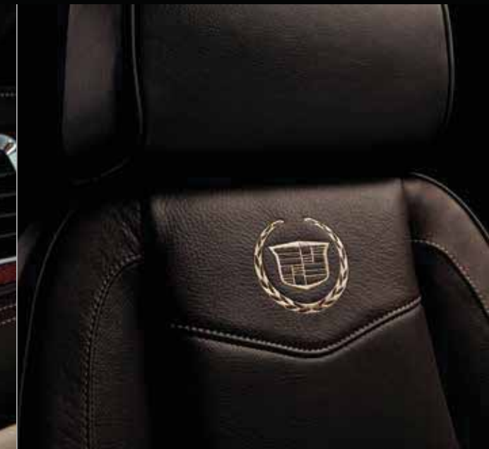
ANILINE LEATHER SEATING SURFACES