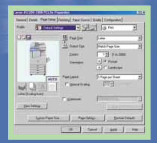
Print Driver Page Setup Tab