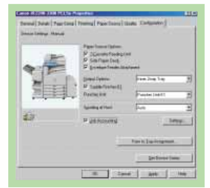
Print Driver Device Configuration Tab

Canon's world-class leadership in image quality—capturing the highest level of detail in every document—is standard on every imageRUNNER 2800. Delivering copy output at 1200 x 600 dpi resolution, and print output at an astounding 2400 x 600 dpi resolution, you'll find yourself asking, "Is this a copy, or the original?"