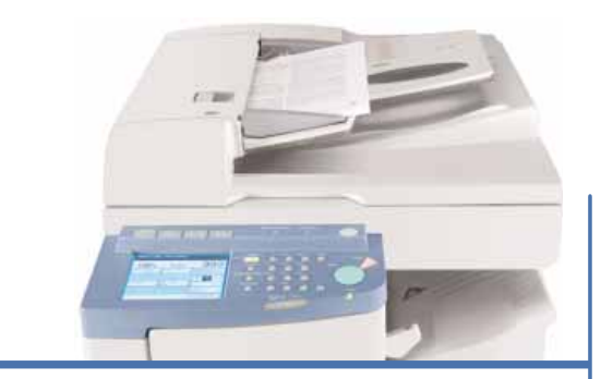
Duplexing Automatic Document Feeder