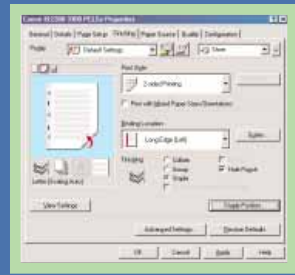
Driver Properties Finishing Tab