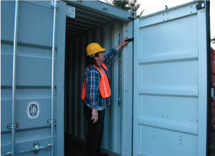
Attach the CSD at the right doorframe. It will stay in place with the use of built-in magnets.