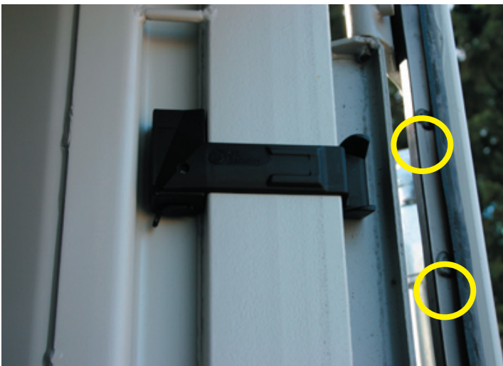
Do not place the CSD at the same height as the rivets of the door.