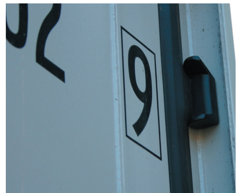
Proper mounting with the door closed.

USA 4001 Fairview Industrial Dr. SE Salem, OR USA 97302 © 2005 General Electric Company All Rights Reserved Licensed by GE from All Set Marine Security AB LZT 10 103, R1A