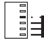
4 pos connector

If programming a transmitter, make sure the batteries are installed. If programming a receiver, make sure power is applied to the RF/Decoder board (power LED is ON). Note that an RF/Decoder board with the six position programming connector can be powered from the programming box and does not need external power.