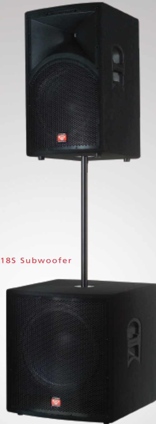
Intense 152 2-Way over Intense 118S Subwoofer

While the thrill of performing with your Intense speakers is why you'll buy them, their reliability and customer support is why you'll like living with them, too.