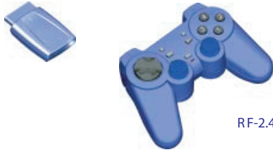
RF-2.4G PC Combo PS2 Gamepad