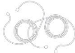
CAT5 Ethernet Cables