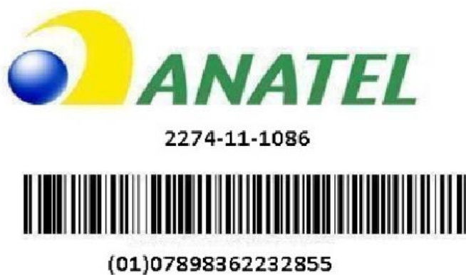
Figure 5 Brazil Regulatory Information