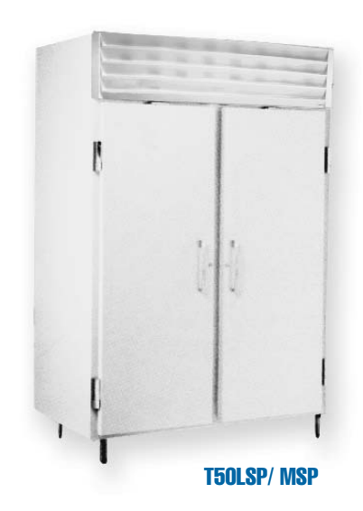
Largest capacity low temperature reach-ins in the industry