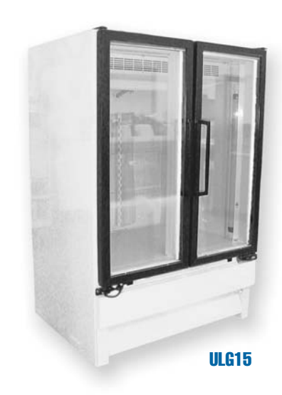
Patented door design eliminates the need for heaters in the door frame