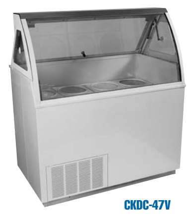
Models shown with Gelato Kit (optional)