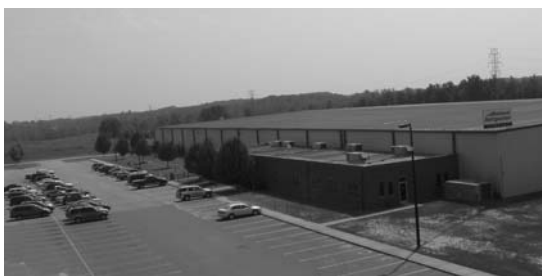
200,000 square foot facility on 25 acres in dedicated industrial park

• Quality is the common denominator of all we do.