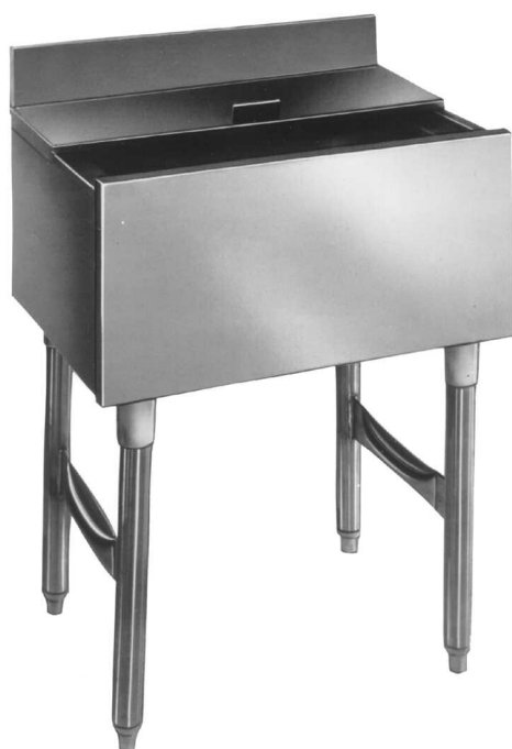
#B2IC-18 ice chest

Item #: _____ Model #: _____ Project #: _____ SIS #: _____