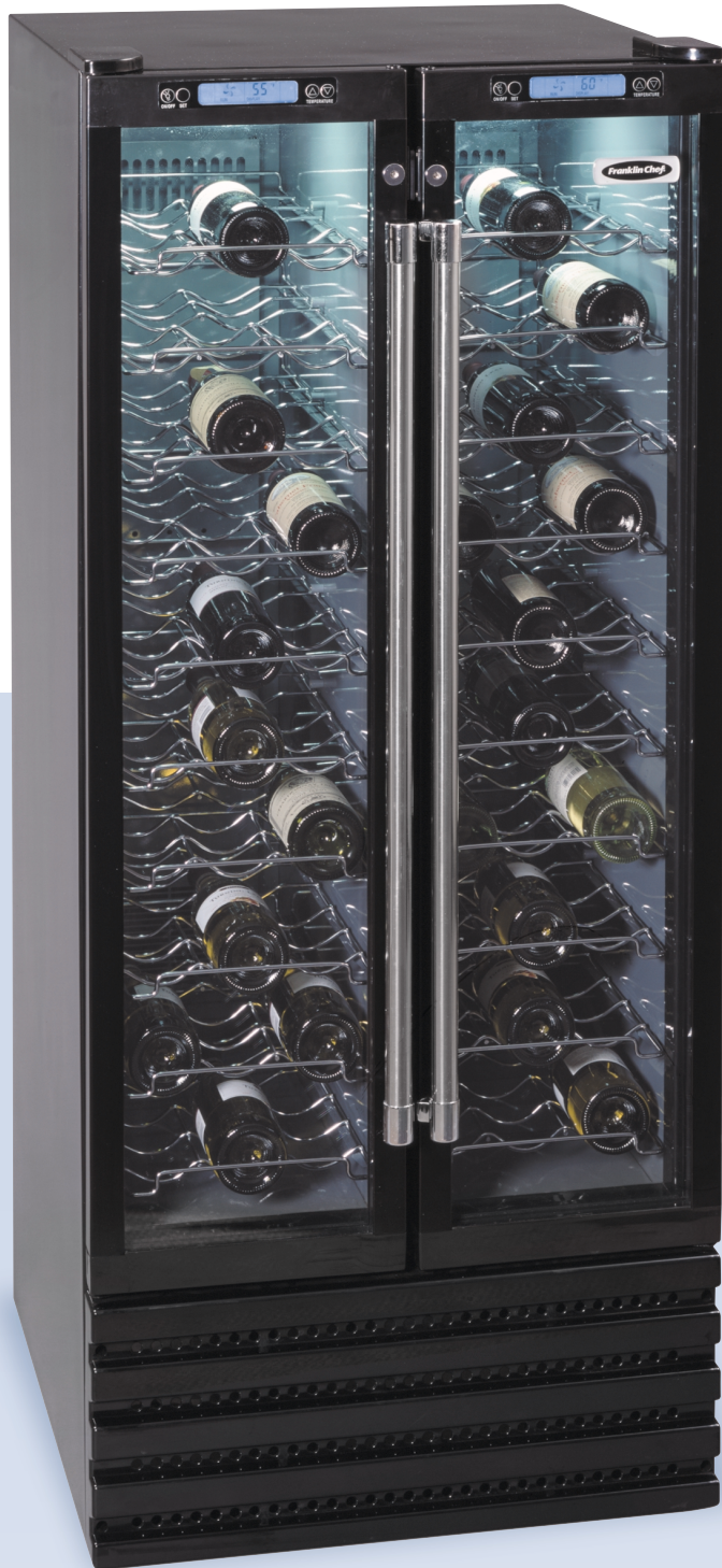
FWC100 100 Bottle Wine Cellar