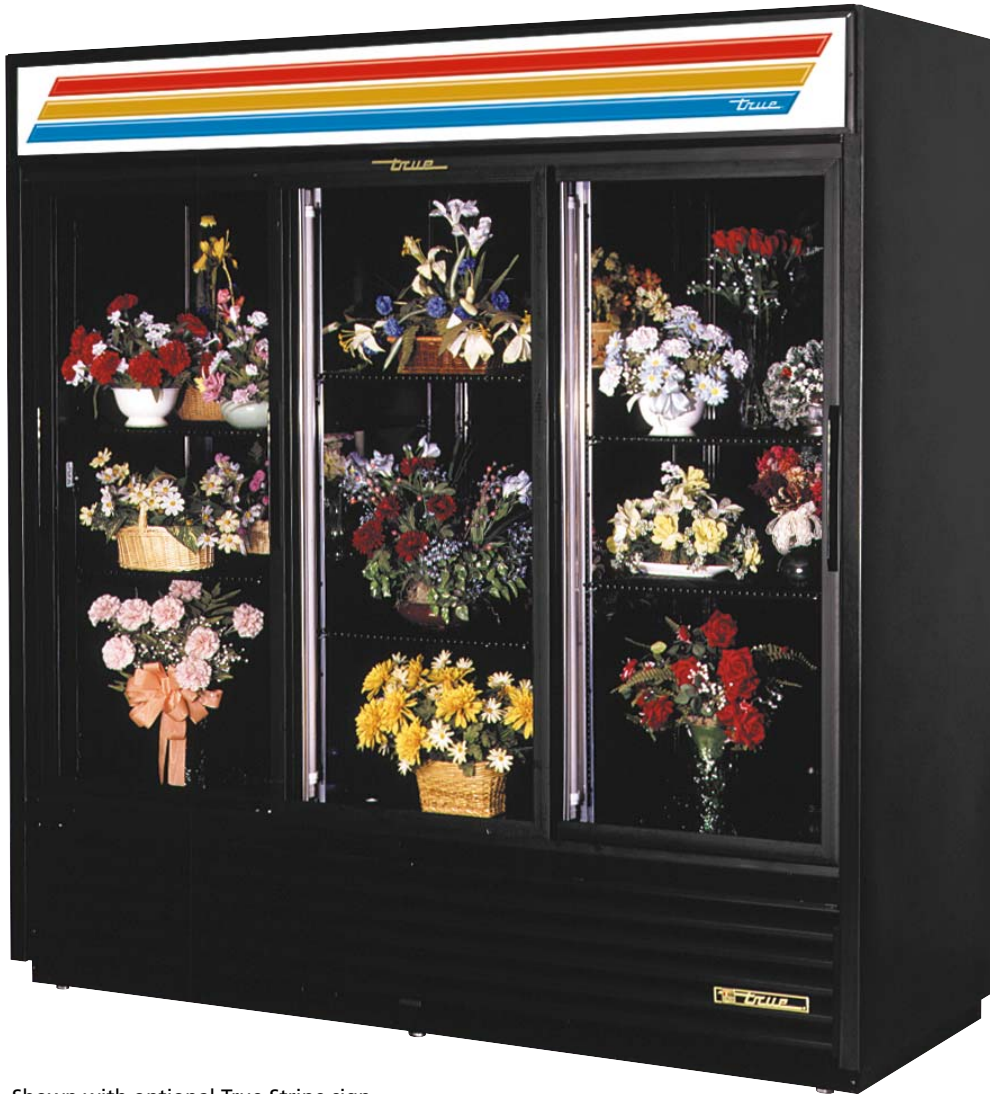
Shown with optional True Stripe sign.