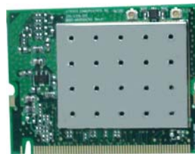
Figure 1 WLM54AG 1A/1B/1C

This mini PCI adapter contains a dual-mode single chip MAC/BB/Radio for IEEE 802.11a or b/g Wireless LAN. Based on the latest industry standard Wi-Fi Certified IEEE 802.11a or b/g specifications, the mini PCI adapter supports key security features like Wi-Fi Protected Access (WPA), WPA2, WEP and 802.1x.