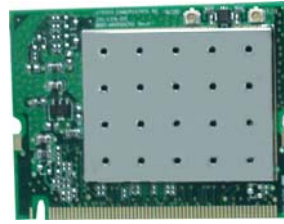
Figure 1 WLM54AG 1A/1B/1C

This mini PCI adapter contains a dual-mode single chip MAC/BB/Radio for IEEE 802.11a or b/g Wireless LAN. Based on the latest industry standard Wi-Fi Certified IEEE 802.11a or b/g specifications, the mini PCI adapter supports key security features like Wi-Fi Protected Access (WPA), WPA2, WEP and 802.1x.