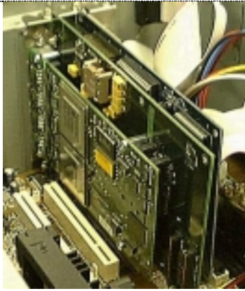
Figure 2-1 This photograph shows the SMAS board installed into a standard PCI slot.

When installing the hardware into a standard PCI configuration system, insert the SMAS board into the PCI slot as shown in Figure 2-1.