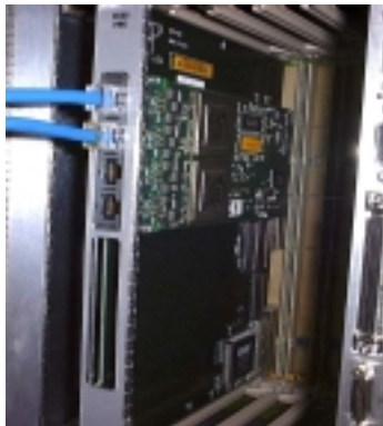
Figure 2-2 The SMAS board may be installed into a cPCI slot as shown.

When installing the hardware into a standard PCI configuration system, insert the SMAS board into the PCI slot as shown in Figure 2-1.