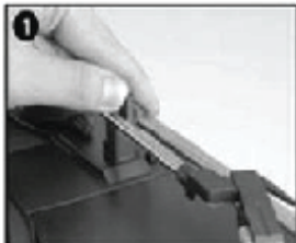
1 Push the arm lock to release the tone arm.

Note: Please exercise care whilst performing this operation so as to avoid the tone arm and audio line wires from any damage.