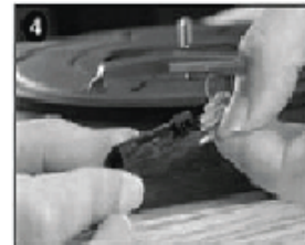
4 Take off audio line from cartridge.