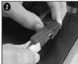
2 Remove cartridge cap to expose needle.