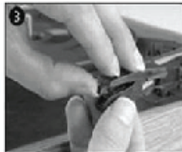
3 Separate cartridge from socket.