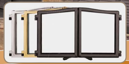
500 Series Door features your choice of three finishes: Black, Gold, or Brushed Nickel.