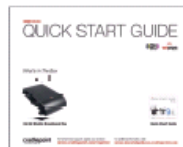
Quick Start Guide