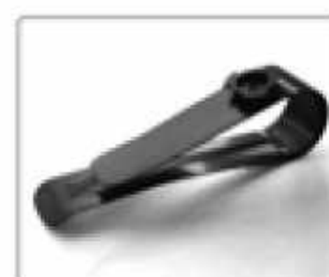
Kit Sunshade panel clip