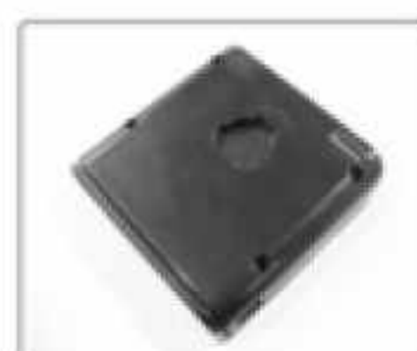
Acceptor of car kit