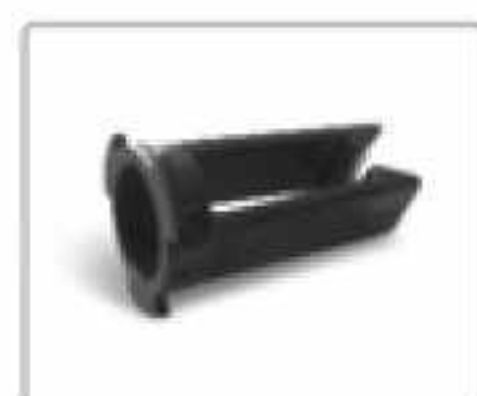
Ventilation rack clip