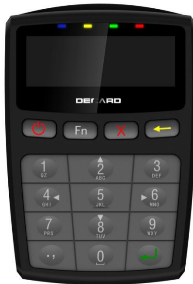
Figure 3-1 X8 Appearance