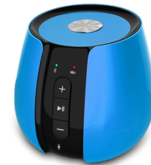
speaker X 1 pcs

On opening the package, please check the speaker mode marked on the box, and check the packing list according to the following: