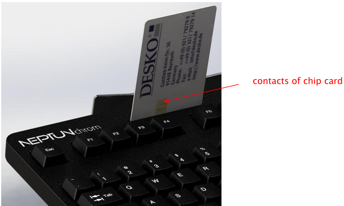
Picture 5: Location of the chip card reader and direction of the chip card contacts

When inserting a card, the contacts must be facing towards you, as shown in the picture below.