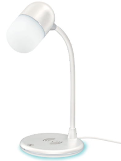
3 - IN - 1 CHARGER, SPEAKER, LAMP USER MANUAL