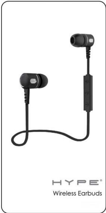
HYPE® Wireless Earbuds

Thank you for purchasing the Jolt Wireless Earbuds. Please read all instructions carefully before using and retain this manual for future use and reference.