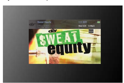
The TV channel changes.