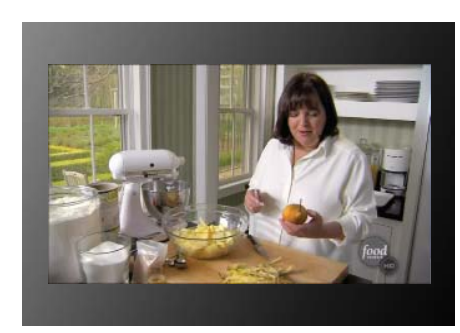
A TV picture appears.