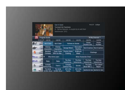
The Program Guide appears.