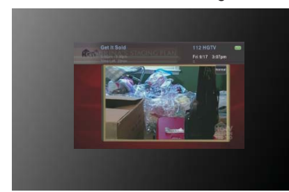
The TV channel changes.