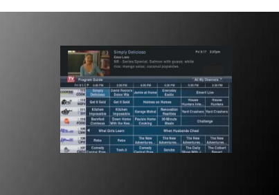
The Program Guide moves up or down.