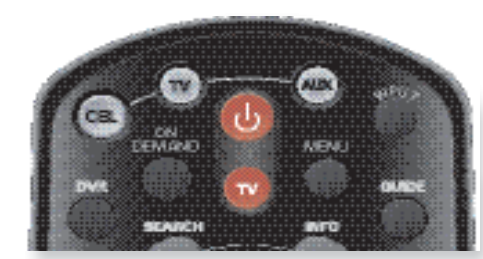
When the CBL button is pressed, it lights up green.