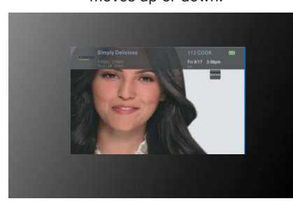
The TV changes to the highlighted channel.