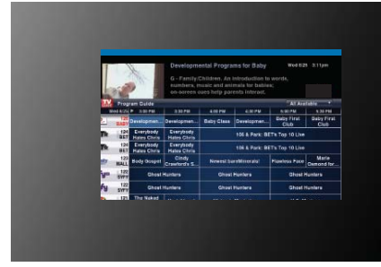
The Program Guide indicates which list you are on. If you are on the All Available list, channels shown in red are not included in your subscription.