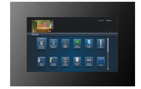
The TV is on a menu screen.