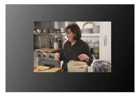
The menu screen is exited and a TV picture appears.