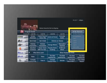
The viewing list drop down menu appears.

b. Press and release the CHANNEL UP DOWN buttons to choose the viewing list you would like to see, then press and release the SELECT button.