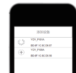
Select the device in the smart phone searching list

3. Pair the device Open pair device in the app, please make sure the Bluetooth is ON when pair the device. When searching and pairing device, please long press on the screen of the device and activate the device (light on). App will search the device automatically, choose the device name and connect the device to the app.