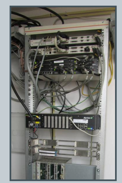
Aprisa XE at Mbanza Ngungu