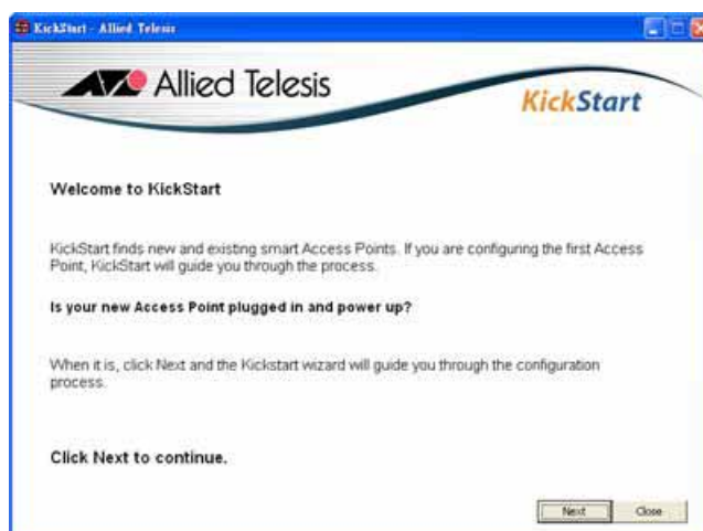
Figure 10: Kick Start Welcome Page