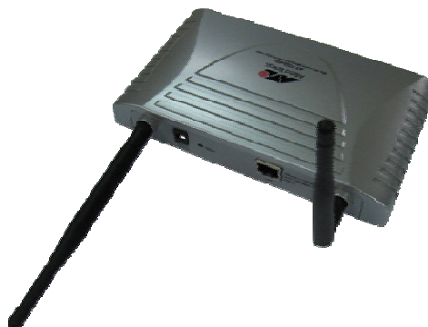
Figure 3: Connecting Antennas

You can try repositioning antennas until you get the best signal strength.