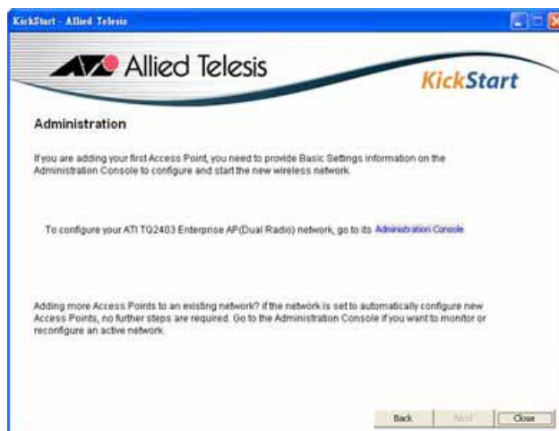
Figure 12: Administration Dialog Box