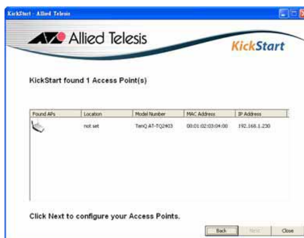
Figure 11: Kick Start Search Results Page