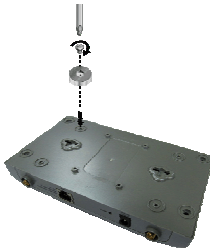
Figure 6: Attaching the Magnets