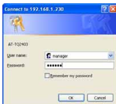
Figure 13: Login Dialog Box

The default user name is " manager " and the default password is " friend "