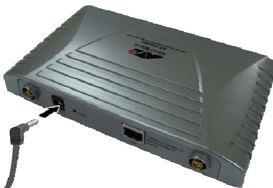
Figure 8: Connecting the Power Adapter