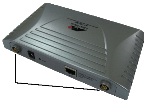
Figure 2: Location of the Antenna Connectors