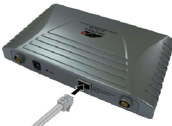
Figure 7: Attaching the LAN Cable