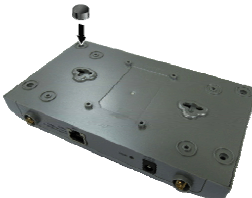
Figure 4: Attaching the Rubber feet