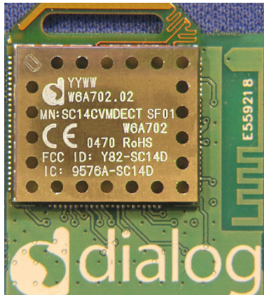
Figure 1 SC14CVMDECT_AF01_SF01 with SC14CVMDECT SFxx module

The “SC14CVMDECT_AF01_SF01” design is a conversion PCB that holds a SC14CVMDECT SF xx module on the top side, while having an SC14CVMDECT AF compatible footprint on the bottom side. Please refer to the following indicative picture: