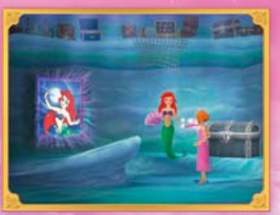
Hint: The best place for new players to start is in Ariel's kingdom.

After each chapter, you'll re-enter the castle of Gentlehaven. To continue your adventures in the same kingdom, press the A Button . To save the kingdom of a new Disney Princess, go to her alcove.