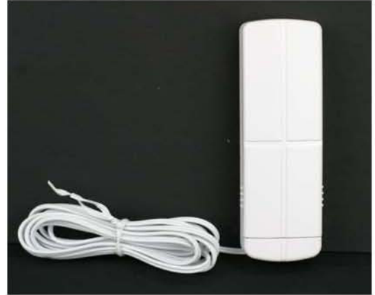
Figure 1 S541.RF

The S541.RF, a member of INNCOM's Integrated Room Automation System (IRAS), is a radio frequency (RF) transmitter designed to function as a battery powered switch monitor for use in the Layer-1 RF IRAS network. It can also be used in conjunction with virtually any "dry contact" switch input to transmit closure information to the e4 thermostat. The S541.RF maintains the same functionality as the S541.RF.IR (infrared) transmitter, reporting the status of the guestroom door to the network and communicating with other IR compatible Inncom devices. The S541.RF(T) is also equipped with a temperature sensor for applications where a low cost remote battery operated temperature sensor is required.