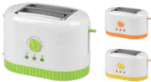
TO 32851 L, T, Y