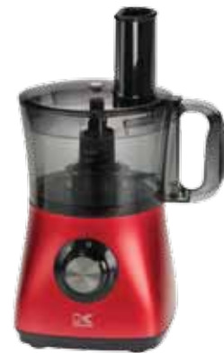
HA 33143 R