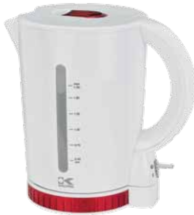
JK 32207 RS