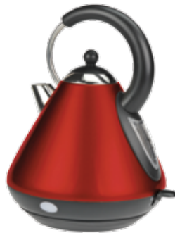
JK 33006 R