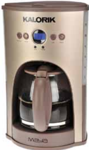
CM 25282 MY