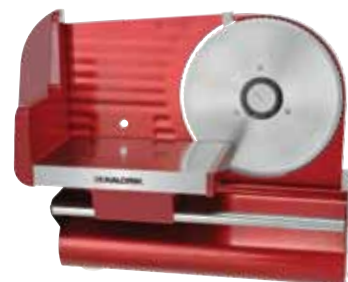
AS 29091 R