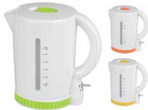
JK 32850 L, T, Y