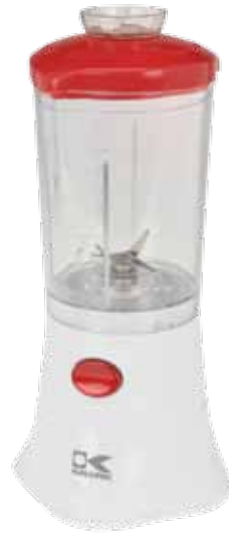
BL 25887 RS