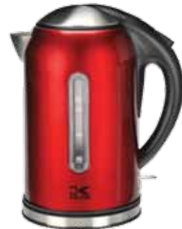
JK 31514 R