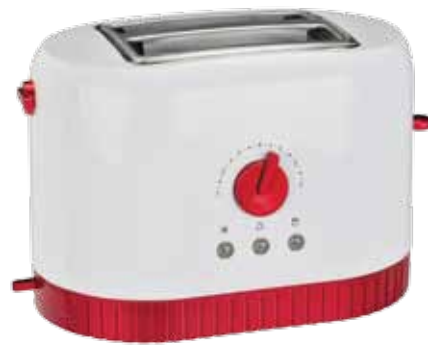
TO 32206 RS