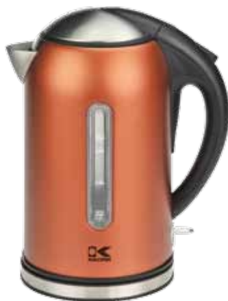
JK 31514 AZ