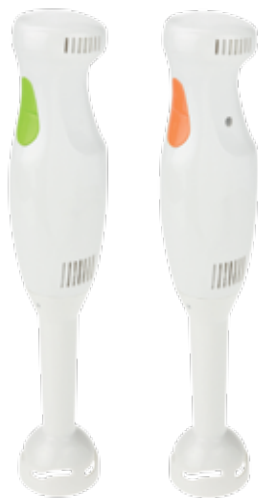
MS 18676 L, T