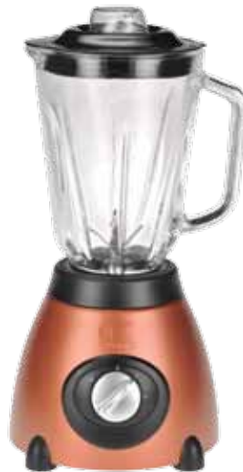
BL 16911 AZ