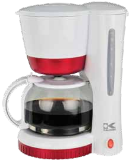
CM 32205 RS