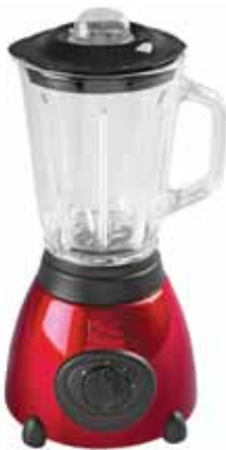
BL 16911 R