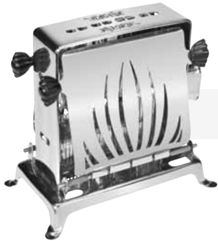
First Kalorik toaster produced in 1930

Today, Kalorik® is a second-generation industry leader. Its passion to create superior products is a guiding force in the company's commitment to new trends in product development, meticulous care for detail, and to maintaining cutting edge manufacturing facilities. It is this careful balance, combined with Kalorik's experience and traditional values that has led to the company's worldwide success.