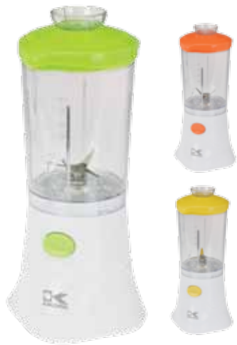
BL 24088 L, T, Y