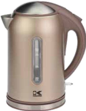
JK 31514 MY