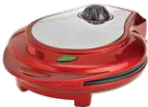
WM 36589 R