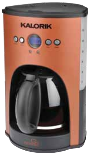
CM 25282 AZ