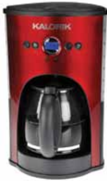
CM 25282 R