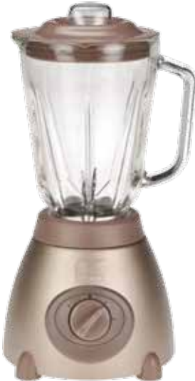
BL 16911 MY