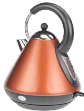
JK 33006 AZ