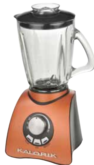
BL 24242 AZ