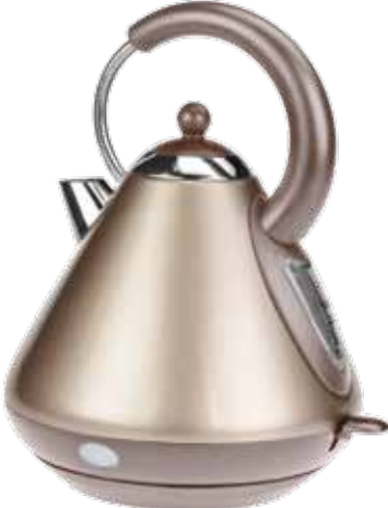
JK 33006 MY