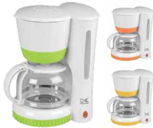
CM 32849 L, T, Y