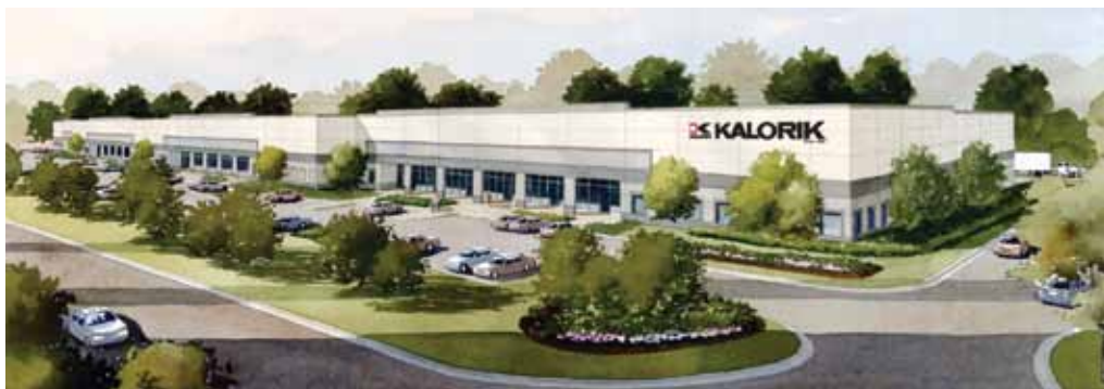
Future Kalorik Headquarters