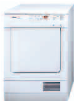
WTL5410UC Axxis™ Dryer (Condensation)