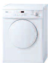
WTA4400US WTA4400CN Axxis+™ Dryer (Vented)