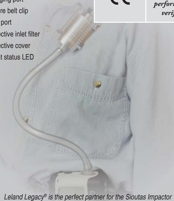
Leland Legacy® is the perfect partner for the Sioutas Impactor