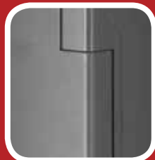
Pry-resistant concealed hinges