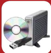
Media and document protection