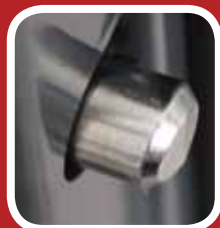
4 locking door bolts