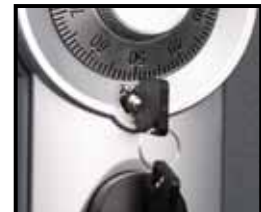
Emergency override key