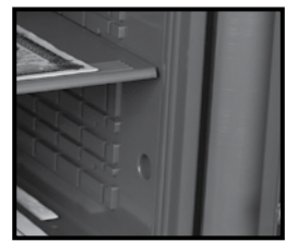
Adjustable storage shelf with multiple positions