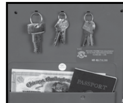
Hanging key rack and passport/document storage