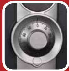
Combination lock with emergency override key

.94 cubic feet internal storage capacity