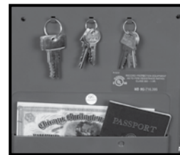
Hanging key rack and passport/document storage