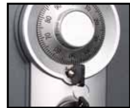
Emergency override key