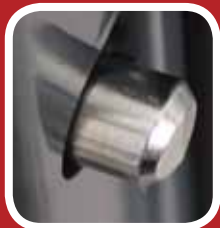
4 locking door bolts