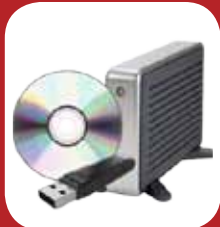
Media and document protection