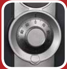
Combination lock with emergency override key

1.31 cubic feet internal storage capacity