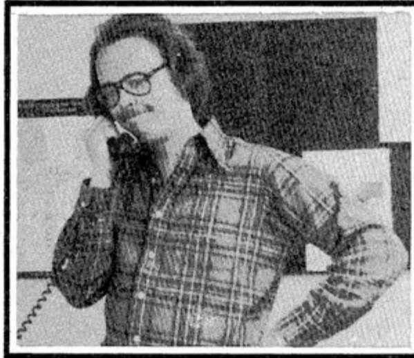
"Good, I'll take all of them."

And on the other side of the coin, the back to nature movement, while it marks an important change in attitude about our relationship with our environment, it doesn't provide solutions for the masses of humanity. Urban life is a reality that must be dealt with. Everyone can't live on a farm.