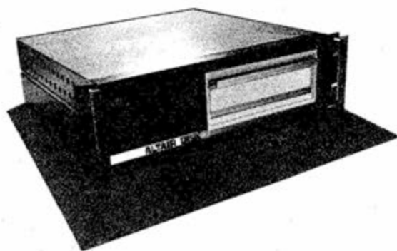
ALTAIR FLOPPY DISK DRIVE UNIT

The Disk Controller consists of two PC boards (over 60 ICs) that fit in the ALTAIR chassis. They interconnect to each other with 20 wires and connect to the disk through a 37-pin connector mounted on the back of the ALTAIR. Data is transferred to and from the disk serially at 250K bits/second. The Disk Controller converts the serial data to and from 8-bit parallel words (one word every 32 usec). The ALTAIR CPU transfers the data, word by word to and from memory, depending on whether the disk is reading or writing. The Disk Controller also controls all mechanical functions of the disk as well as presenting disk status to the computer. All timing functions are done by hardware to free the computer for other tasks. Power consumption is approximately 1.1 amperes from the +8v (VCC) line for the two boards.