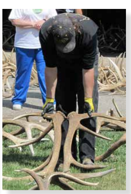
A Scout volunteer matches a pair of antlers to sell as a set at the auction.