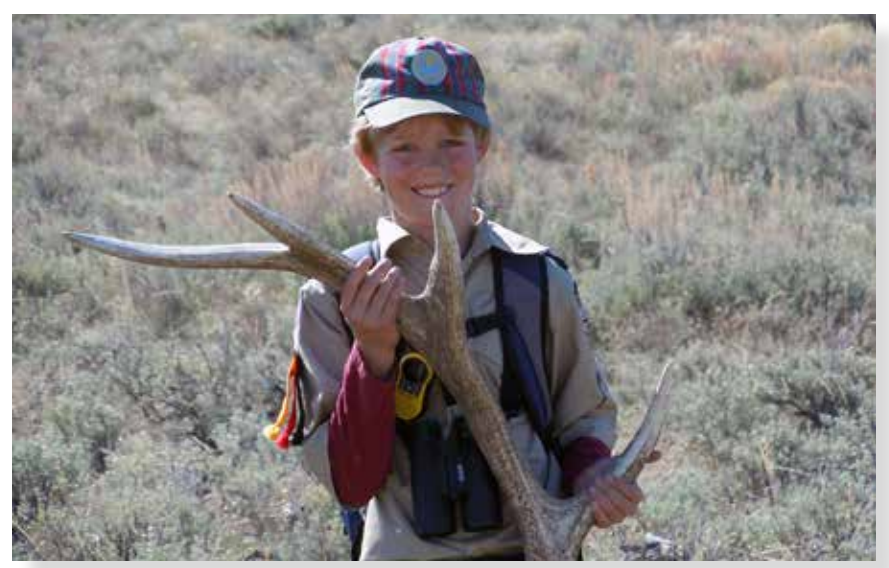
A Scout proudly holds up his find duing the spring antler collection.

but it helps avoid damage to equipment that could occur if the antlers are accidentally run over during refuge management operations like supplemental feeding, spring harrowing, or irrigating.