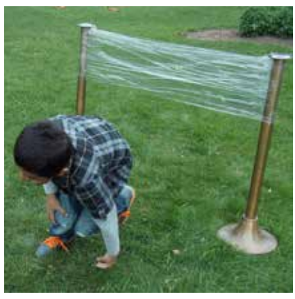
A student climbs under plastic wrap used to represent a glass window during his race through a bird migration obstacle course. Other hindrances along the route included a predator, fragmented habitat, invasive species, and bright city lights.

While the focus of the students' February visit to the Refuge was wintering elk, the spring trip in late May centered on birds. Students rotated through stations to learn about bird characteristics, beak adaptations, and migration. The students also had an opportunity to observe birds and write in journals they've been keeping throughout the year.