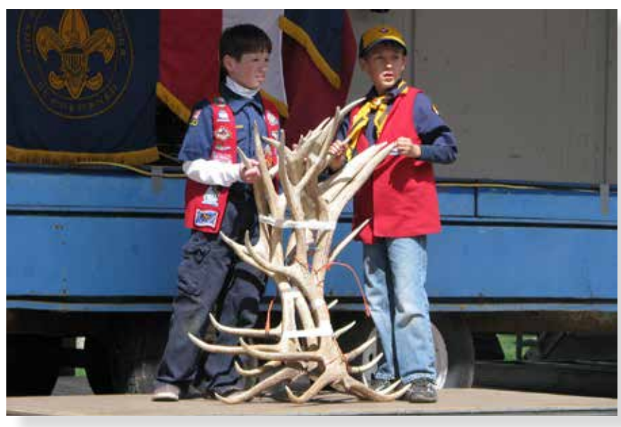
Two scouts stand on the stage with an auction lot during the bidding process.

several hours to look at the selections prior to the auction's 10:00 start. Though the auction itself lasts several hours, the work for many Scout leaders will not end till the last chores are completed in late afternoon or early evening.