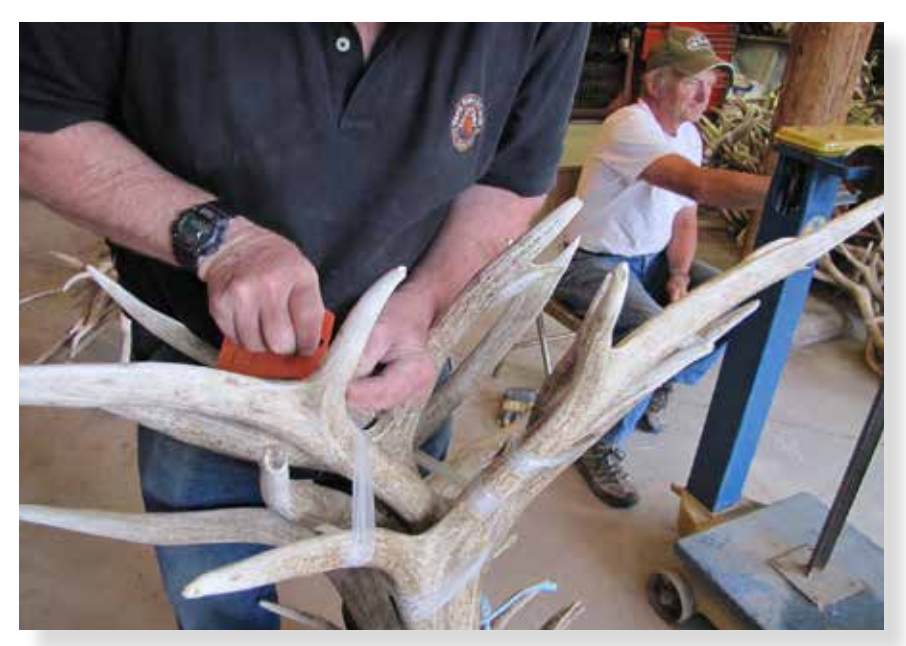
Groups of antlers are weighed and tagged in preparation for the auction.

Individual antlers are grouped into various sized bundles, then taped or tied together to create a cluster that will be sold as one auction item. Scout leaders look for antlers that have the same curvature, color, and texture with