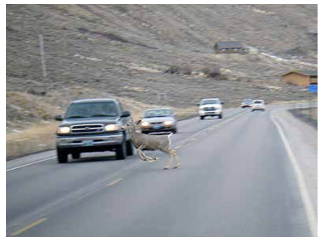
A mule deer darts into traffic from the area near the pathway, narrowly averting a collision with a truck.

wildlife. Refuge waters support a wild population of Snake River cutthroat trout, a unique variety of cutthroat species and the only trout native to the area. However, Brook, brown, and rainbow trout are also present in Refuge waters. By harvesting non–native trout, anglers can reduce the impact on the native cutthroat trout population. Hunting, too, is used as a management tool on the Refuge, helping reduce the number of bison and elk to meet population objectives developed with the Wyoming Game & Fish Department. Hunting was identified in the 2007 Bison and Elk Management Plan as a necessary means to achieve population goals.