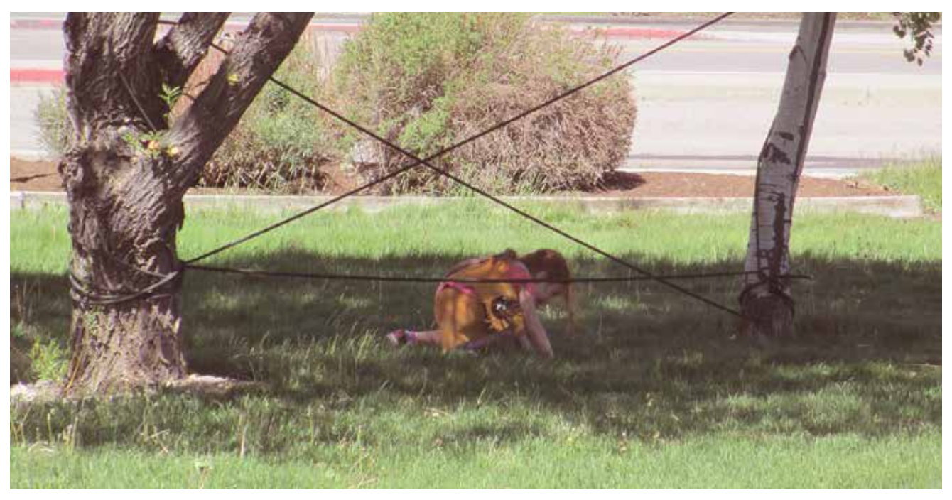
A participant in the migration obstacle course navigates under a simulated power line during her timed trip between two points.

Two traveling Duck Stamp exhibits made a brief stopover at the National Elk Refuge last week, letting visitors enjoy beautiful artwork while learning about U.S. Fish & Wildlife Service conservation programs. Both Federal Duck Stamp and Junior Duck Stamp art work were on display at the Jackson Hole & Greater Yellowstone Visitor Center from June 11 through June 15.