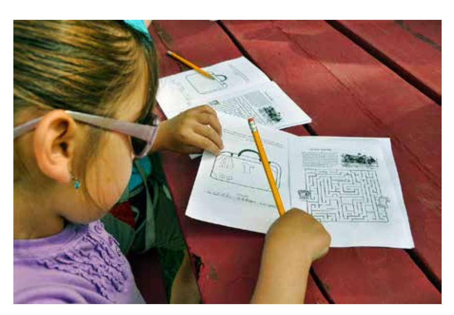
As part of the lesson, students were tasked with listing what they would have packed as they moved out west and what they would have left behind. One student, thinking about what was most important to take along, simply wrote, "memories."

was much more representative of a one-room homestead. Inside the back porch, students placed signs representing a bed, a wood stove, a chair, and other objects around