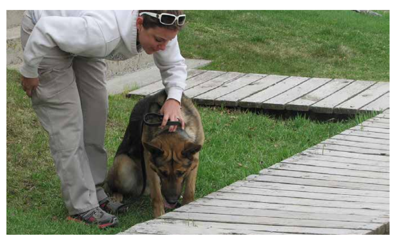
A dog alerts on a package of marijuana hidden under the boardwalk as part of a training exercise near the historic Miller House.