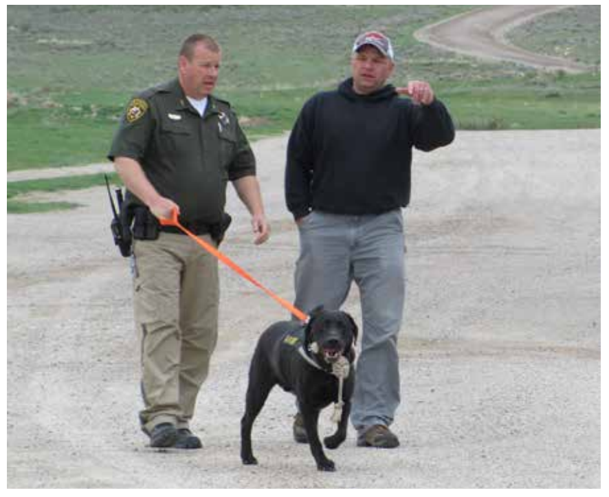
An officer and instructor debrief after running a black lab through a drill.

development and certification of law enforcement canine teams and their administrations. The association offers nationally accepted certifications throughout the year across the United States.