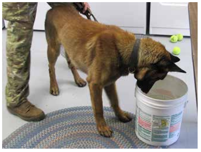
Two \ dogs \ have \ successful \ finds \ of \ naracotics \ hidden \ for \ training \ purposes, \ stashed \ under \ a \ Miller \ Ranch \ outbuilding \ (left) \ and \ inside \ a \ laundry \ facility \ near \ the \ volunteer \ RV \ sites \ (right).