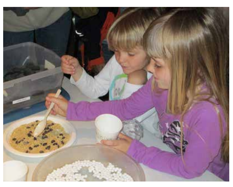
The same two siblings use a more appropriate tool than the clear plastic tongs they tried first to pick up "bugs." The activity focused on beaks and bills.

Students in all 50 states have the opportunity to participate in the Junior Duck Stamp curriculum and enter the contest. The Wyoming winners from four age categories are scheduled to be on display at the visitor center from July 26 – August 26.