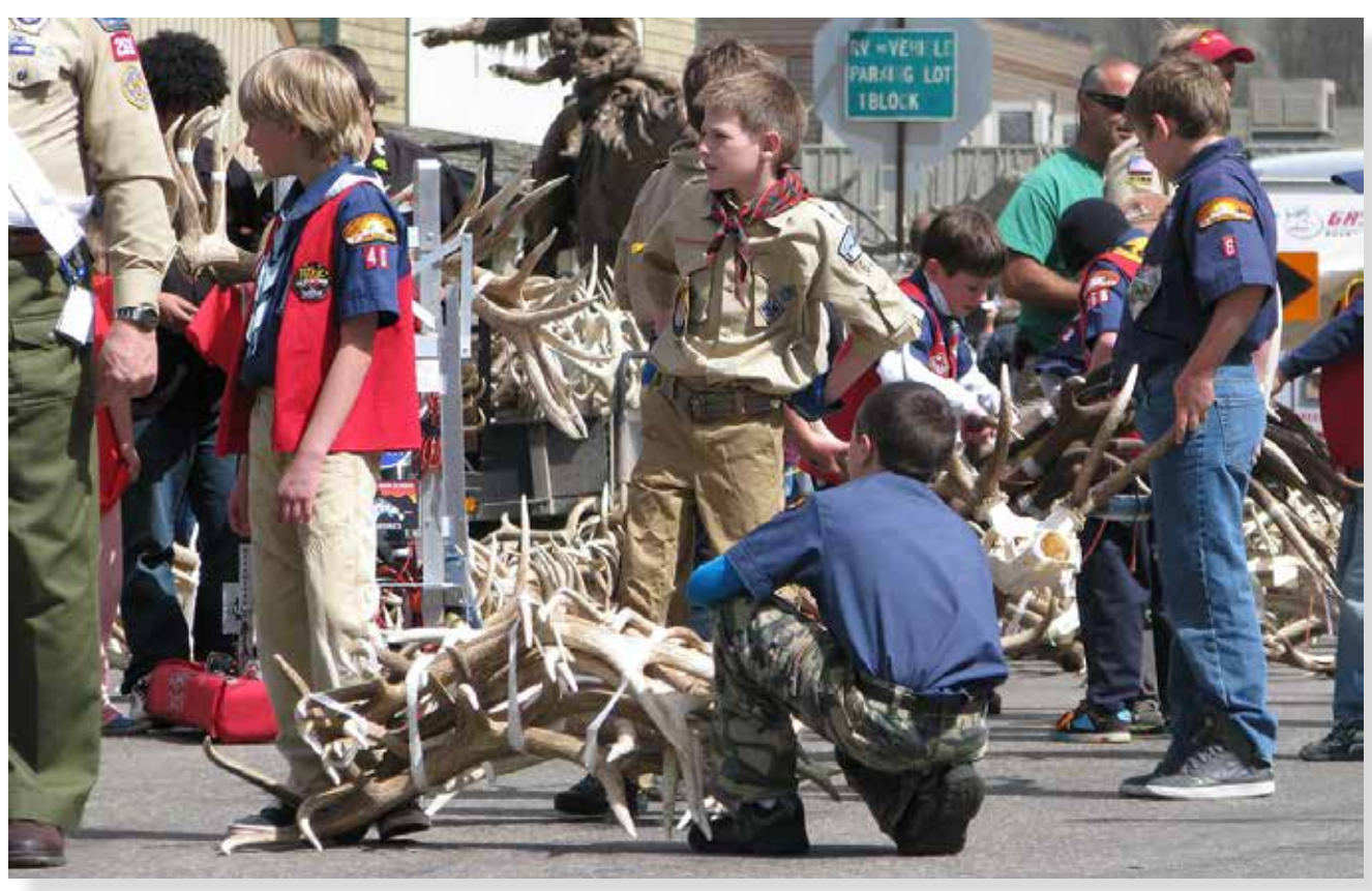
Several Scouts line up to take turns carriying antler bundles onto the stage during the annual antler auction on Jackson's Town Square.

With this year's annual antler auction only days away, both National Elk Refuge staff and Jackson District Boy Scout leaders are busy making final preparations for Saturday's event. The renowned sale on the Jackson Town Square generates critical funding for Refuge habitat projects. This year, the Scouts will see an increase in the percentage of revenue they receive from the Refuge for assistance with the auction.