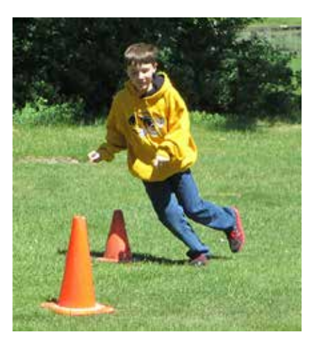
Another "bird" blinded by blinking lights from antennas, radio towers, and wind generators skillfully dodges obstacles with his eyes closed on his travels through the migration obstacle course.

avoiding mock predators, windows, buildings, and other obstacles while dealing with fragmented open spaces and invasive species.