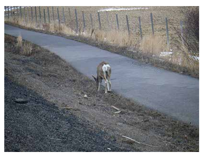
Mule deer are often spotted in the spring adjacent to North Highway 89 and the pathway.