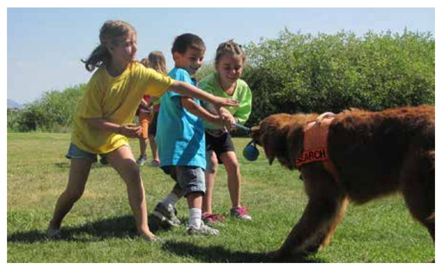
Above: Roscoe tugs on a toy he receives as a reward for a successful find. Below: Roscoe receives plenty of lovin' as he takes a break from his search and rescue demonstration.

The programs this week were sponsored by the generous support of the Grand Teton Association, a nonprofit cooperating association