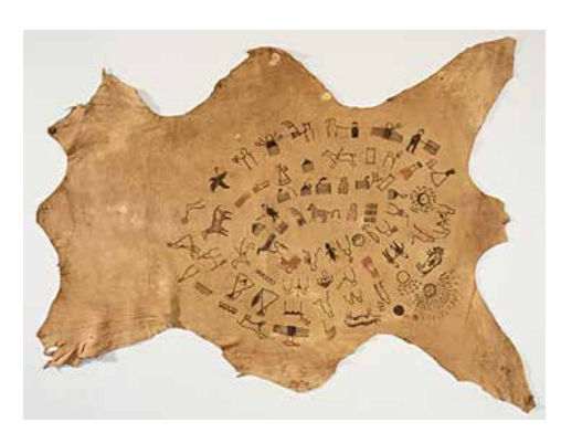
Left: Lone Dog Winter Count, from Lakota Winter Counts, an on-line exhibit

■ 9:30 –11:00 AM; repeated from 1:15 – 2:30 PM: Two crafts projects will be available. Participants can use brown paper in the shape of a bison hide to construct a winter count, which is a documented history or calendar where events are recorded by pictures. Artists can tell a story from a time period of their choice. Guests can also use paper and yarn to make a variation of a parfleche rawhide bag decorated with geometric shapes. A parfleche was traditionally used for carrying food, personal items, and tools.