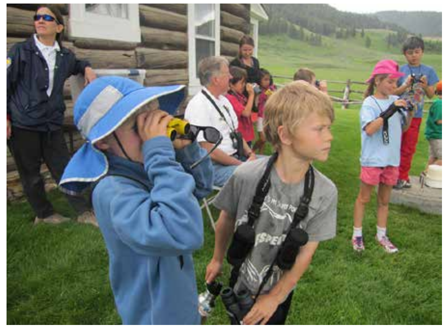
Binoculars enabled the students to see coyotes, bald eagles, and an osprey which they hadn't seen with their naked eyes.

the room to imagine the limited space inside a typical homestead compared to that of a modern–day home.