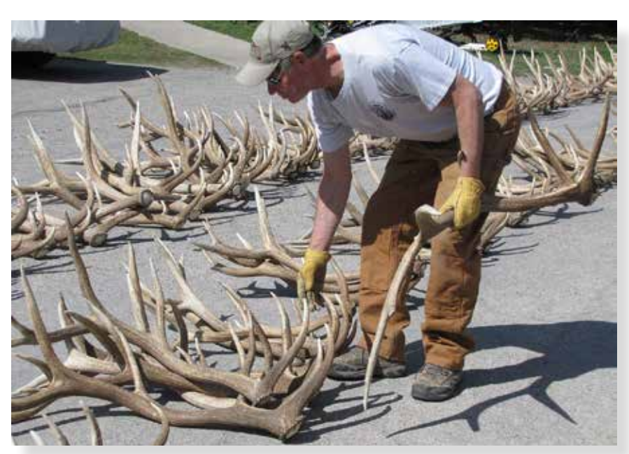
Sorting the antlers and creating individual sale lots is a full day's work, completed by a large pool of Scout volunteers.

A week before the auction, Scout leaders begin preparing the collected antlers for sale. Volunteers sort the antlers, separating out those that are broken, non-typical, or heavy six, seven, and eight-point in size.