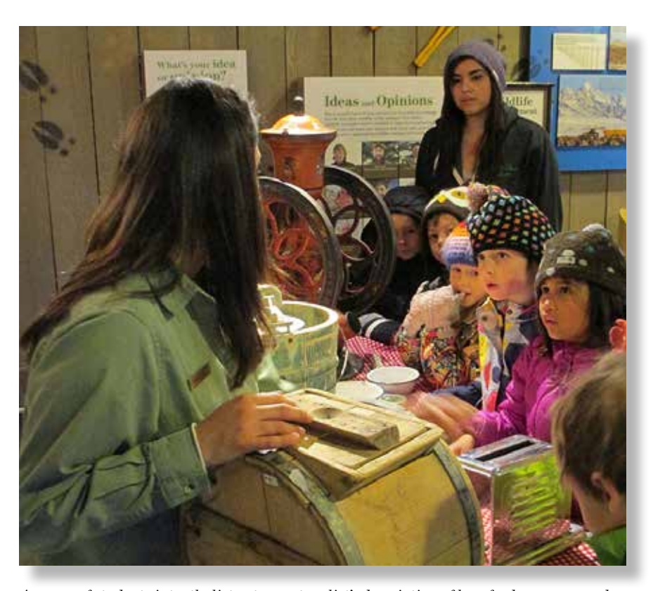
A group of students intently listen to a naturalist's description of how food was prepared in an earlier era.

The two organizations will combine resources again on Monday, February 18 to offer lessons and crafts with a wildlife theme. The event activities and schedule will be posted at www. fws.gov/nationalelkrefuge/ JacksonHoleVisitorCenter.htm.