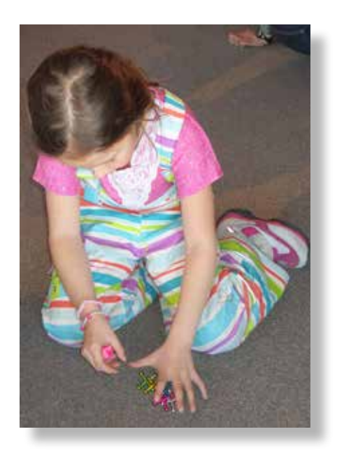
Children all over the world have played some form of jacks. The game, along with variations of it, was common in the late 1800s and early 1900s.