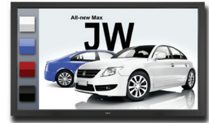
TOUCH INTEGRATED SERIES Integrated Multi-Touch V series displays with protective anti-reflective glass ideal for all touch applications.