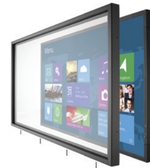
V SERIES PROTECTIVE TOUCH OVERLAYS Allows for the ability to add HID compliant multi-touch to V series displays.