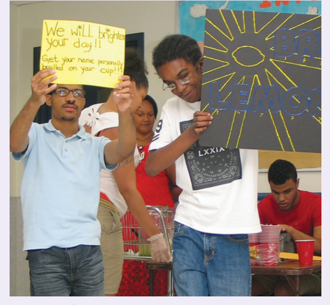
Students from The Heilbrunn School encouraging customers to purchase a cold beverage from the school's student-run lemonade stand.

For example, some of our older students participate in work internships at local businesses to develop job skills, interpersonal skills and most importantly a sense of pride in their work. During the school's summer session, a number of students participated in water safety instruction classes at a local park. Another recent activity was a student-run lemonade stand which required students to create advertising posters, make lemonade, interact with customers and collect money.