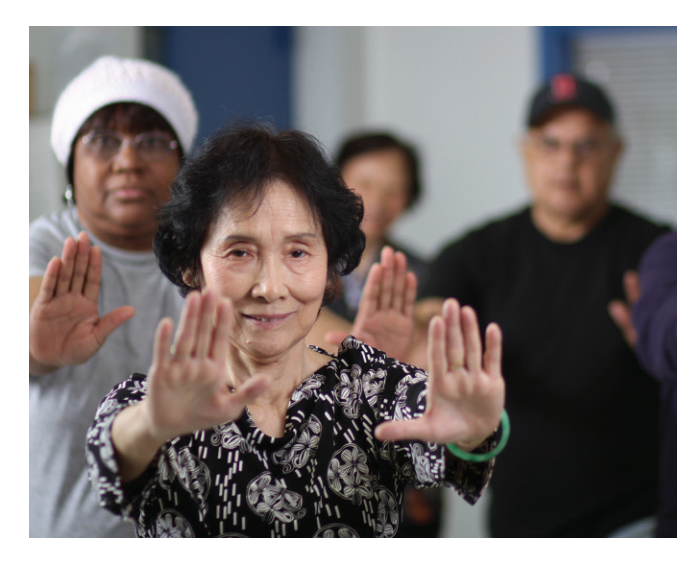
GuildCare clients stay active with the program's Tai Chi classes.

help with memory, like word games. And to keep our clients physically active, we even provide a Tai Chi program! We offer a wide variety of sessions that are both enjoyable and therapeutic."