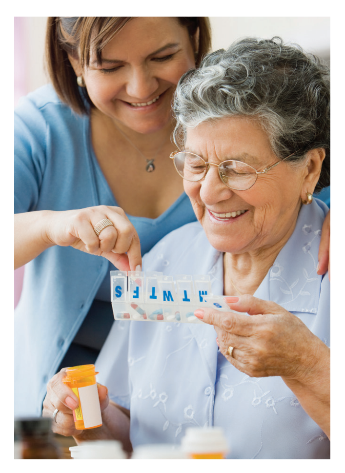
GuildNet members receive assistance with all their healthcare needs including medication management.

Effective long term health care is a team effort. An interdisciplinary team including a nurse care manager, a primary care physician, a social worker and a mental health liaison develops and modifies an individualized plan of care for each Guild-Net member. To foster a strong support network, the team incorporates input from the member,