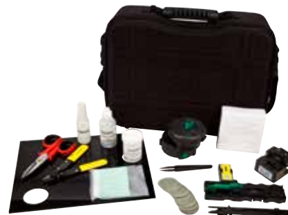
3M™ Crimplok™+ SC/APC Connector Kit 8765-APC for 3M™ Crimplok™+ Connectors 8700-APC