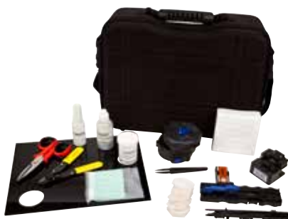
3M™ Crimplok™+ SC/UPC Connector Kit 8765-UPC for 3M™ Crimplok™+ Connectors 8700-UPC and 6700 Series

3M™ Crimplok™+ Connector Kits 8765-UPC/8765-APC provide the tools needed to terminate 3M Crimplok+ Connectors 8700-UPC 6700 and 8700-APC series, respectively. Both kits contain the same fiber preparation tools including a high quality cleaver, a work surface and a case with an integrated hook for easy hanging. Each kit contains a specific 3M™ Crimplok™+ Protrusion Setting Tool and 3M™ Crimplok™+ Nano Finishing Tool, depending upon the connector type. UPC tools provide a square finish while APC tools provide a 8° angled finish.