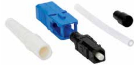
3M™ Epoxy SC Connector

3M Epoxy Connectors feature a pre-radiused, zirconia ceramic PC ferrule designed to provide contact of fibers for low reflection and low insertion loss. The 3M epoxy SC and FC connectors are intermateable within NTT specifications. These connectors are built to exacting ferrule length tolerances for maximum machine polish yield and bulk packaged to maximize factory cable assembly efficiency. 3M Epoxy Connectors can also be used with an anaerobic adhesive for fast-cure interconnect applications.