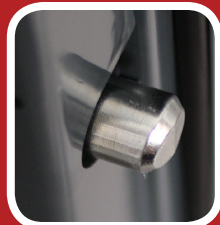
6 locking door bolts