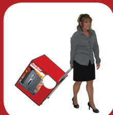
Handy Hauler™ wheels and lift up handle