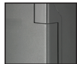
Pry-resistant concealed hinges