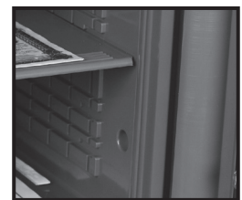
Adjustable storage shelf with multiple positions