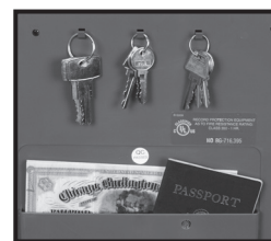
Hanging key rack and passport/document storage