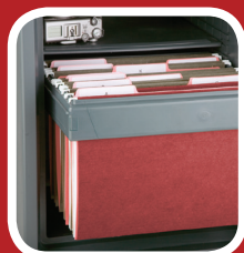
Includes removable pull-out hanging file folder rack