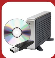
Media and document protection