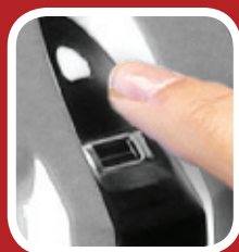
Fingerprint biometric entry system (Program up to 4 fingerprints)