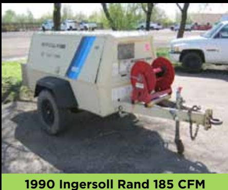
1990 Ingersoll Rand 185 CFM Towable Generator