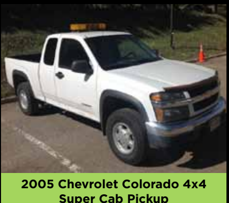
Super Cab Pickup