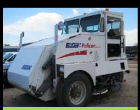
2000 Elgin Pelican Series P Street Sweeper