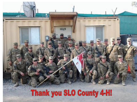
Thank you SLO County 4-H!

Thank you Nipomo Foothill and Huasna Valley for your generous contributions to the "Treats for Our Troops" project last month! We look forward to seeing what San Luis Obispo County 4-H members can do!!