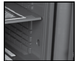
Adjustable storage shelf with multiple positions