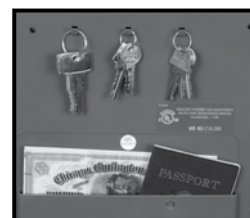
Hanging key rack and passport/document storage