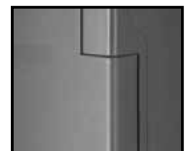
Pry-resistant concealed hinges