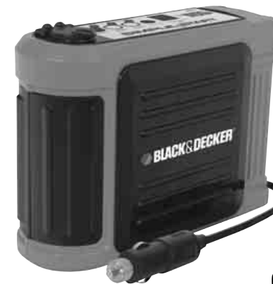
Catalog Number BB7B-CA

Thank you for choosing Black & Decker! Go to www.BlackandDecker.com/NewOwner to register your new product