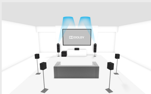
Perspective detail for 7.1.2 setup

This refers to how many overhead or Dolby Atmos enabled speakers you can use in your Dolby Atmos capable setup.