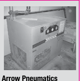
Inc Refrigerated Air Dryer, MdI A-150-2, 10 HP

Torch Carts (1 w/ Gauge) Red Lion Trash Pump w/Briggs Eng