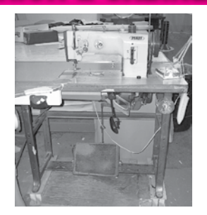
PFAFF Commercial Sewing Machine Mdl KI 1245 w/Table