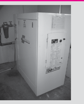
Champion Rotary Air Compressor w/Water Separator, Mdl. EFC99B, 25 HP, 125 PSIG, Mfg 11/03