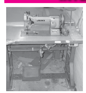
JUKI Commercial Sewing Machine MdI LU-563 w/Table