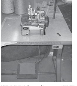
KARPET King Surger, Mdl 123