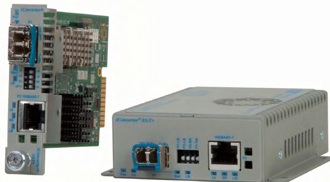
SFP+/XFPs not included

The standalone iConverter XGT+ has built-in mounting brackets. It is DC powered and available with an external AC/DC power adapter, or a terminal connector for wiring directly to a DC power source.