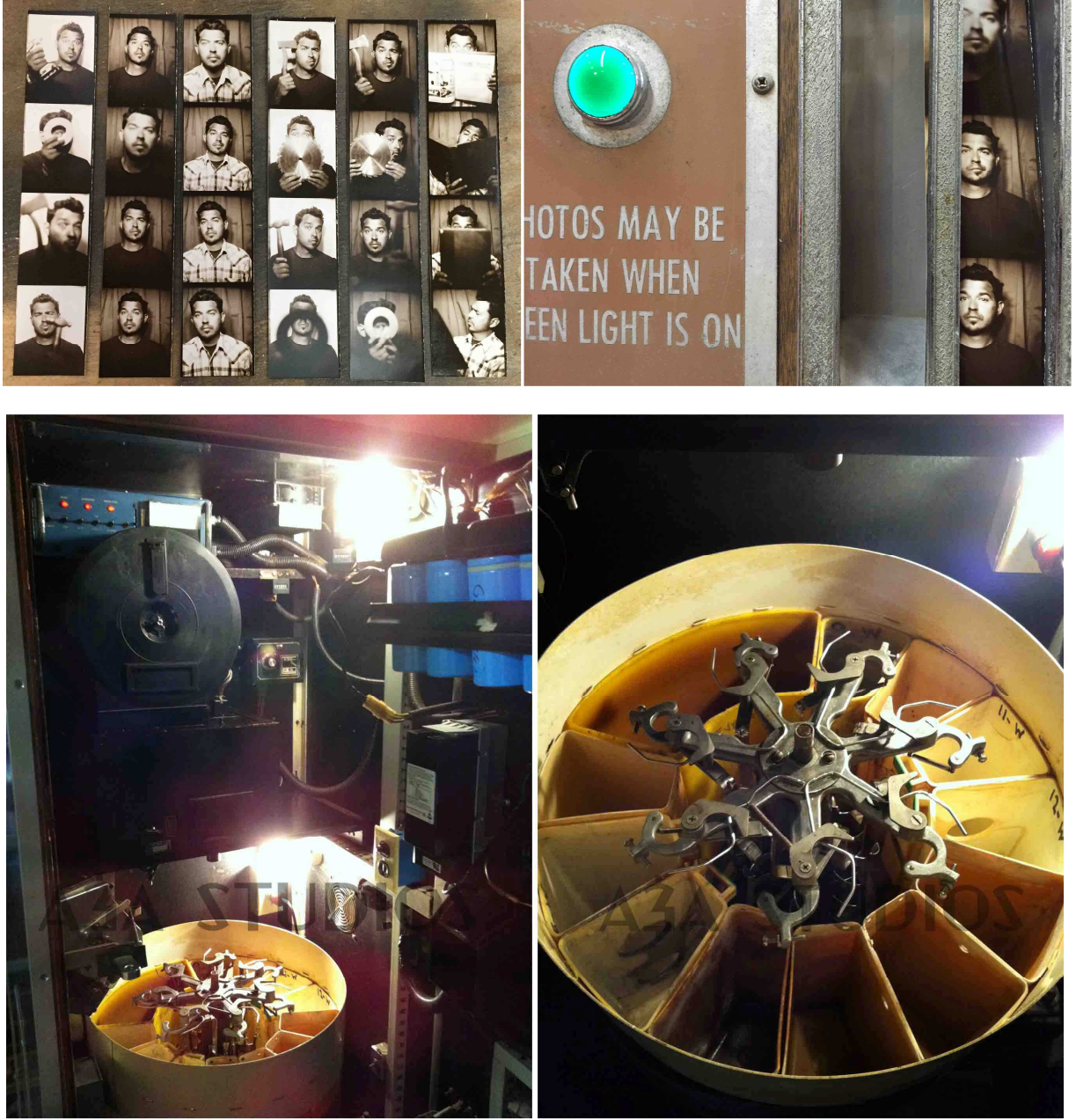
Inside a Vintage Model-21 Photo-Me AP10 System Photobooth (showing tanks, arms, spider assembly, plate camera & paper magazine)

At A&A Studios, we are constantly fielding calls about where to buy photobooth paper and chemistry. Over the years, we have sold many types of photographic papers and chemicals. For a myriad of reasons, A&A Studios has transitioned out of such sales mainly due to poor profit margins, lack of demand, and the amazing hassle of shipping chemistry both domestically and internationally. With all that said, we felt that the best way to keep these vintage photobooths alive was to spread the love and share the information that we have gained through much trial, error, and experience! So, here goes it....!